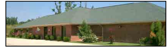
OAKDALE ASSISTED LIVING/ ALLISON GARDENS

This facility is licensed for 70 residents with licensed nursing staff on duty 24 hours/7 days a week. Each resident is provided with a PRIVATE ROOM with a semi-private bath, basic cable, and access to a beautician/barber. Whirlpool baths, physical, occupational and speech therapy are also available on a medically indicated basis. We have an individual approach to residents' care with liberalized diet menus and medication passes. Monthly and quarterly meetings are conducted between staff, residents, and family members to exchange information, discuss a resident's progress and what the future holds. There is a Pharmacy Consultant, Registered Dietitian, and a Medical Director on staff. Activities are scheduled daily for residents including special outings for those wishing to participate IE: shopping, dining out, fishing, boating and just sightseeing during the holidays. Spiritual services are available each week and several church buses frequent the facilities.