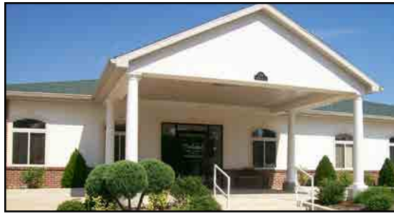
OAKDALE CARE CENTER

For some individuals, a few essential personal interventions are plenty to allow for the safe and healthy pursuit of quality-of-life. For other individuals, a much higher level of care is indispensable. But realistically, a personal match in facilities today may not be the right choice in the future. At Oakdale, there are personal alternatives which allow movement to match evolving quality-of-life needs, without the stress of leaving a familiar location, old friends and well-known staff.